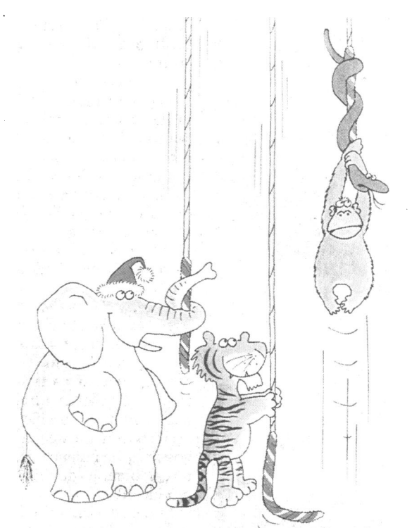
FIG 1-Popular conception of a common hazard of bell ringing – the high speed lift

Four of the eight injuries reported in table II required first aid or medical attention and one was potentially very serious. The figures indicate that although less than 2% of ringers injure themselves each year, this represents about 724 injuries a year throughout the British Isles and roughly half of these require first aid or other medical attention.