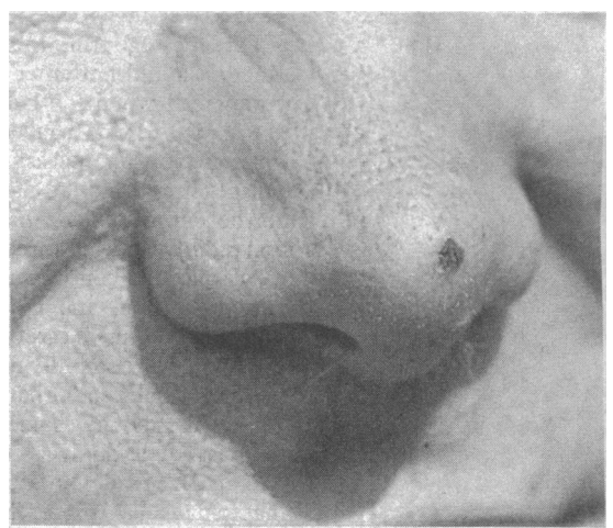
FIG 3-Abrasion to tip of the nose caused by ringer's thumbnail while trying to grasp flapping rope

Most injuries to experience ringers seem to occur in moments of inattention; these are "one off," rather