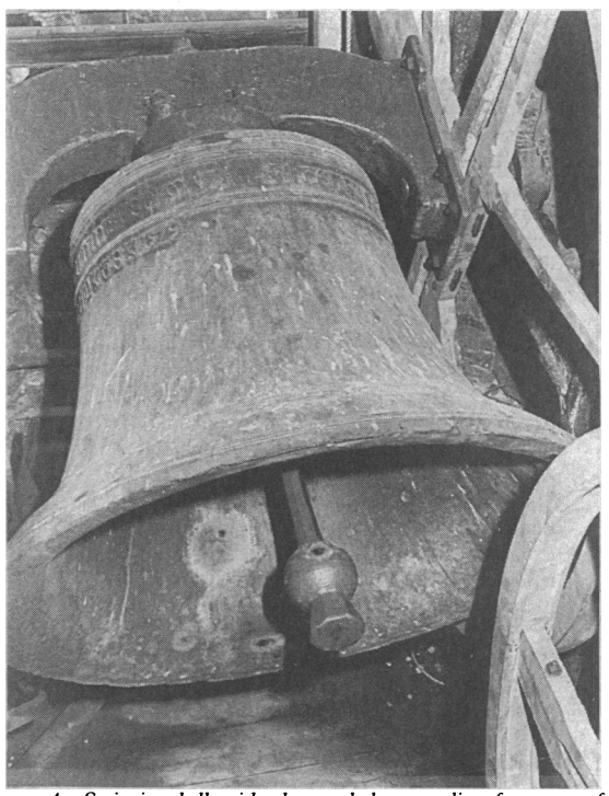
FIG 4—Swinging bell with clapper bolt protruding from top of headstock. This bell weighs 579 kg (fifth bell, Sutton Bonnington)

Ringers also suffer from the wear and tear of repetitive movements—tenosynovitis and degenerative arthritis, particularly of the hands, wrists, and thumbs. It is difficult to say whether this is primarily due to ringing or if the activity aggravates a pre-existing condition. At least one medical ringer had to abandon ringing because of an exacerbation of rheumatoid arthritis. As may be expected, inflammatory disease of the elbows and shoulders is also common.